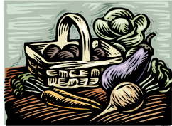
Fresh food from our garden to your table.

Joining a CSA (Community Supported Agriculture) means you buy a share of the local farmer's produce for the summer. You sign up to be a member in early spring and pay a fixed amount to receive a weekly delivery of naturally grown fruits and vegetables fresh from the farm.